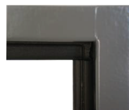
Gasketing: Heavy Duty EPDM Rubber

For detailed specifications see submittal sheet