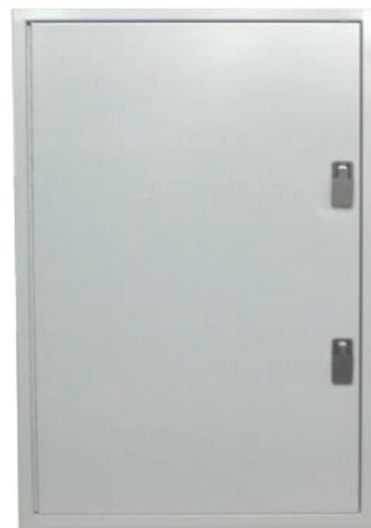
STC-2436F3G in Gray